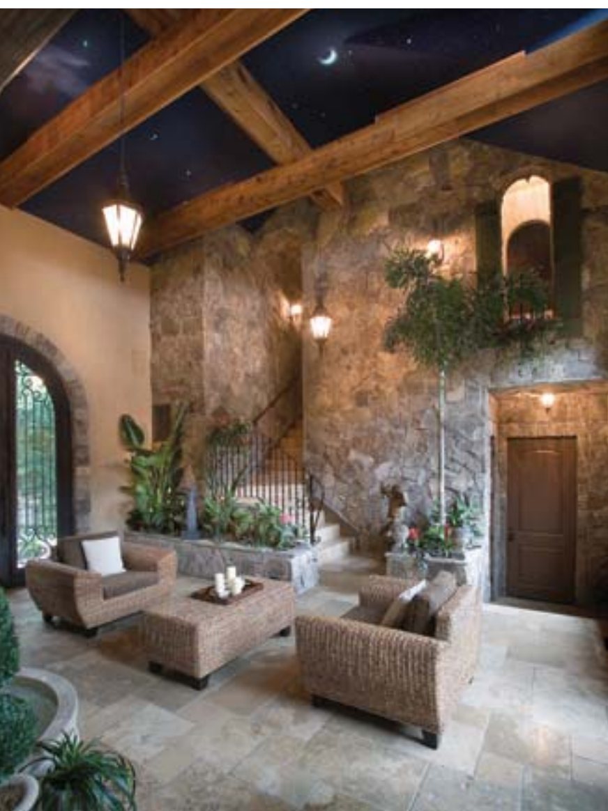
The piazza captures the warmth of an Italian street scene, with stone and stucco walls and a moonlit and star-filled "sky."