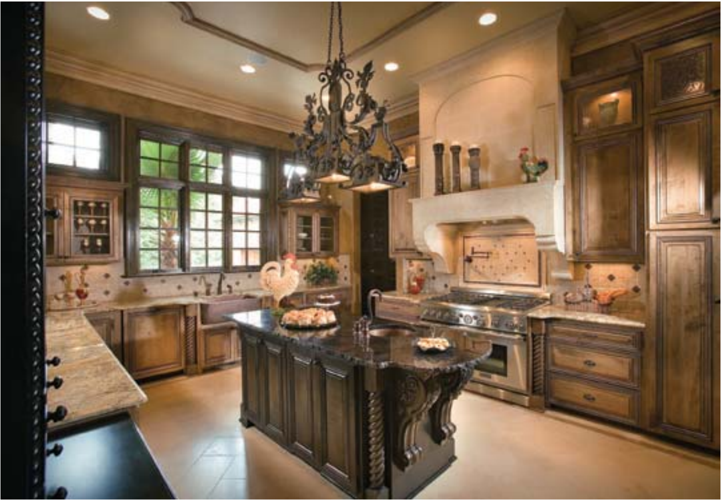
The kitchen is the heart of any Italian home, and this one features state-of-the-art appliances and conveniences concealed behind beautiful, traditional cabinetry.