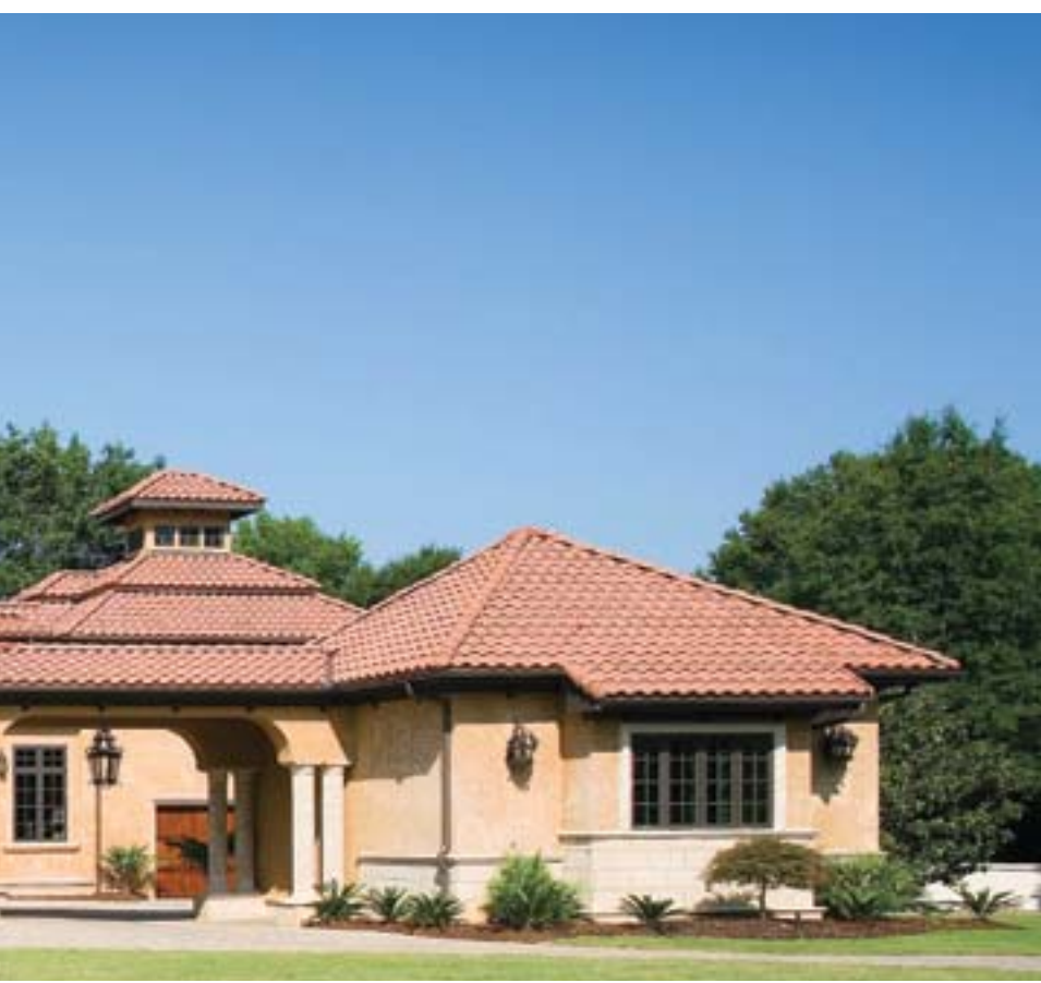
Below Left: Entertaining family and friends is a priority for this outgoing family, and the design of their home's extensive outdoor living areas reflects that desire.