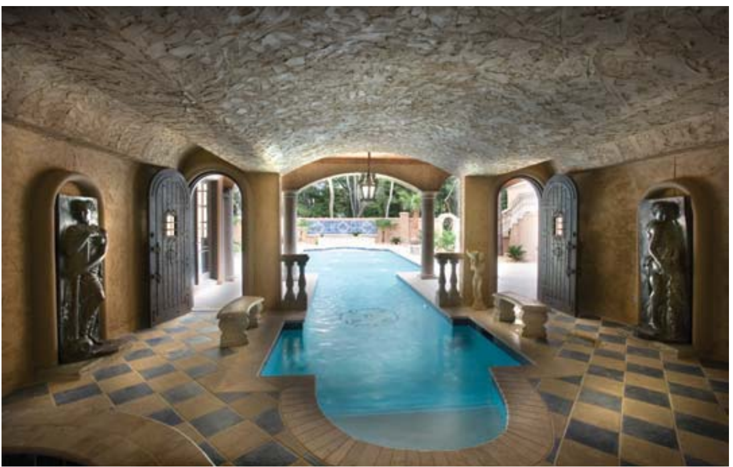
One of the features of the home's lower level is an authentic Roman grotto with a lap pool that leads to the extensive outdoor living area.

recreates an Italian street scene. The room, which is an interior space, has been transformed to look like a street, complete with a cobblestone "street" floor, outdoor stucco walls that look like the exterior of imagined buildings dotted with wrought iron balconies and a fountain. Above, the ceiling has been painted to mimic the sky, complete with constellations that light up at night. Walk past mature plants up the steps into one of the "buildings," and you'll find an artist's studio with a cupola skylight and three French doors with balconies designed by Rosemary, a 20-year board member of the Guild of Charlotte Artists and the Charlotte Art League. "I love art and painting, but my first love is houses," she says as she displays striking works in oil whose inspiration comes from her past and her passions and travel. Also off the hearth room is an outdoor kitchen for "al fresco" dining and an entertaining area complete with fireplace.